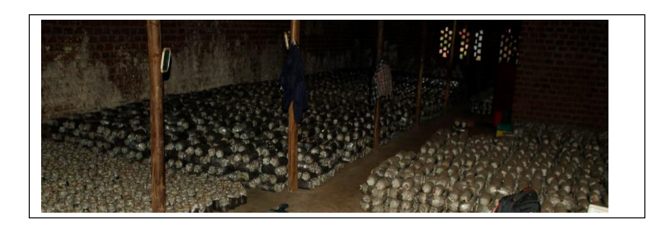
Mushroom gardens in our incubation house